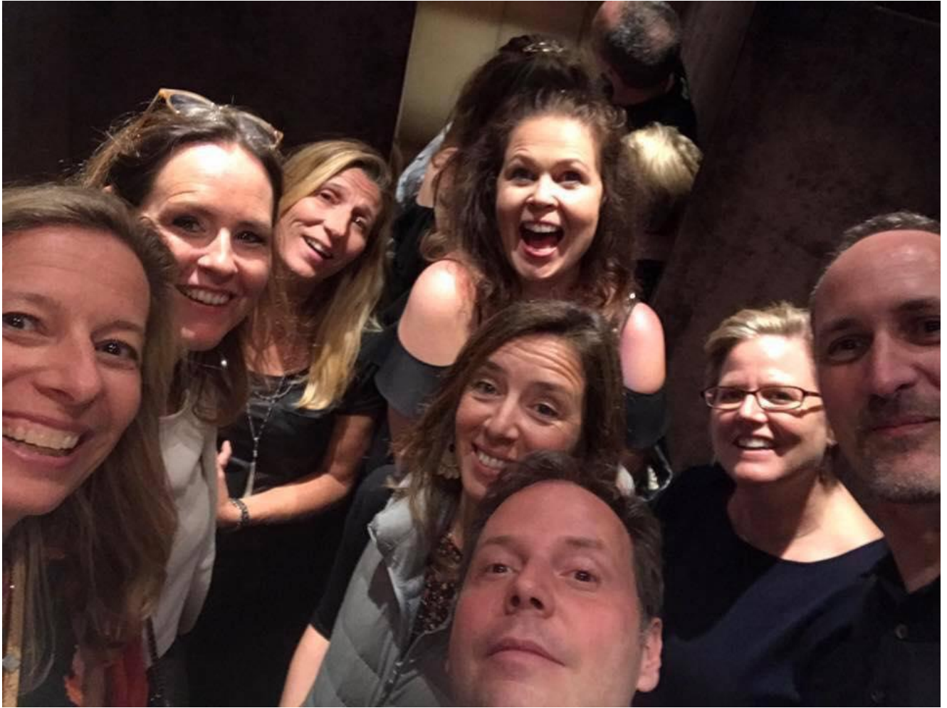
Partying at the Library