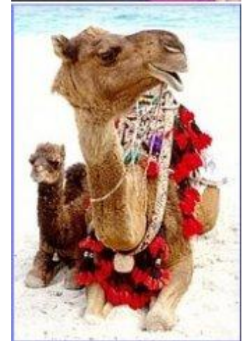
TOP: Iman El-Banhawy ('89); BOTTOM: Photo by Bibi Eng ('89): From 'Photo essay: Kish Island'